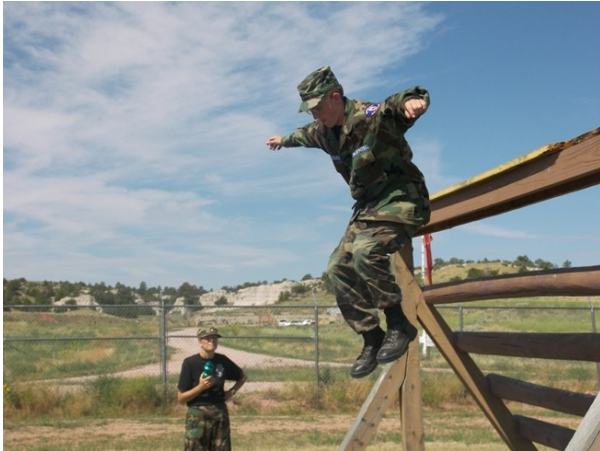
I'm flying! No wait... never mind.