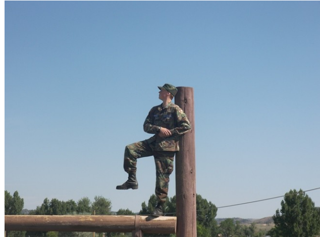
Got a little captain in you? Oh wait, he's only a lieutenant...