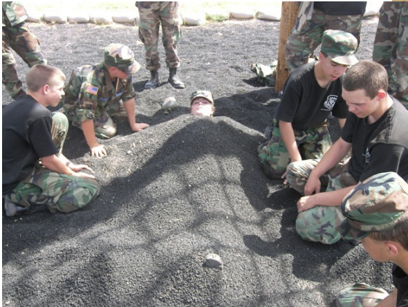
I'm not dead! I'm just sleepy, that's all.