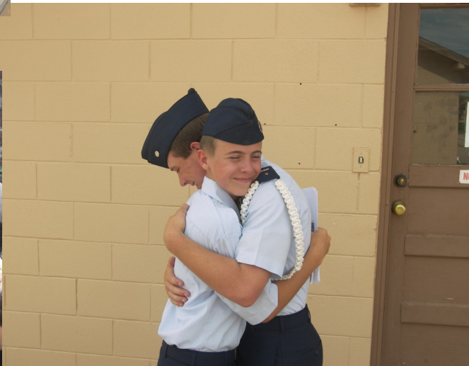
There's the love!